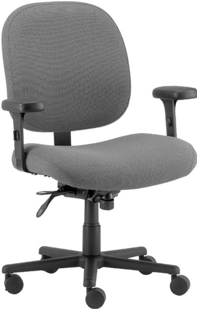
Model 10,000 Office with optional armrest and gel arm pads