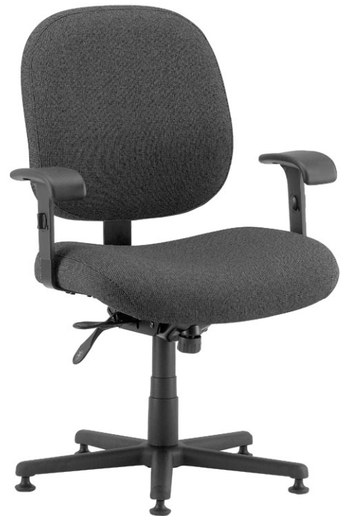
Model 10,000 Industrial with optional armrest and polyurethane arm pads